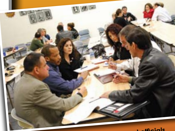
Federal and state law enforcement officials from Mexico met in El Paso

The meeting in El Paso was hosted by El Paso Police Department